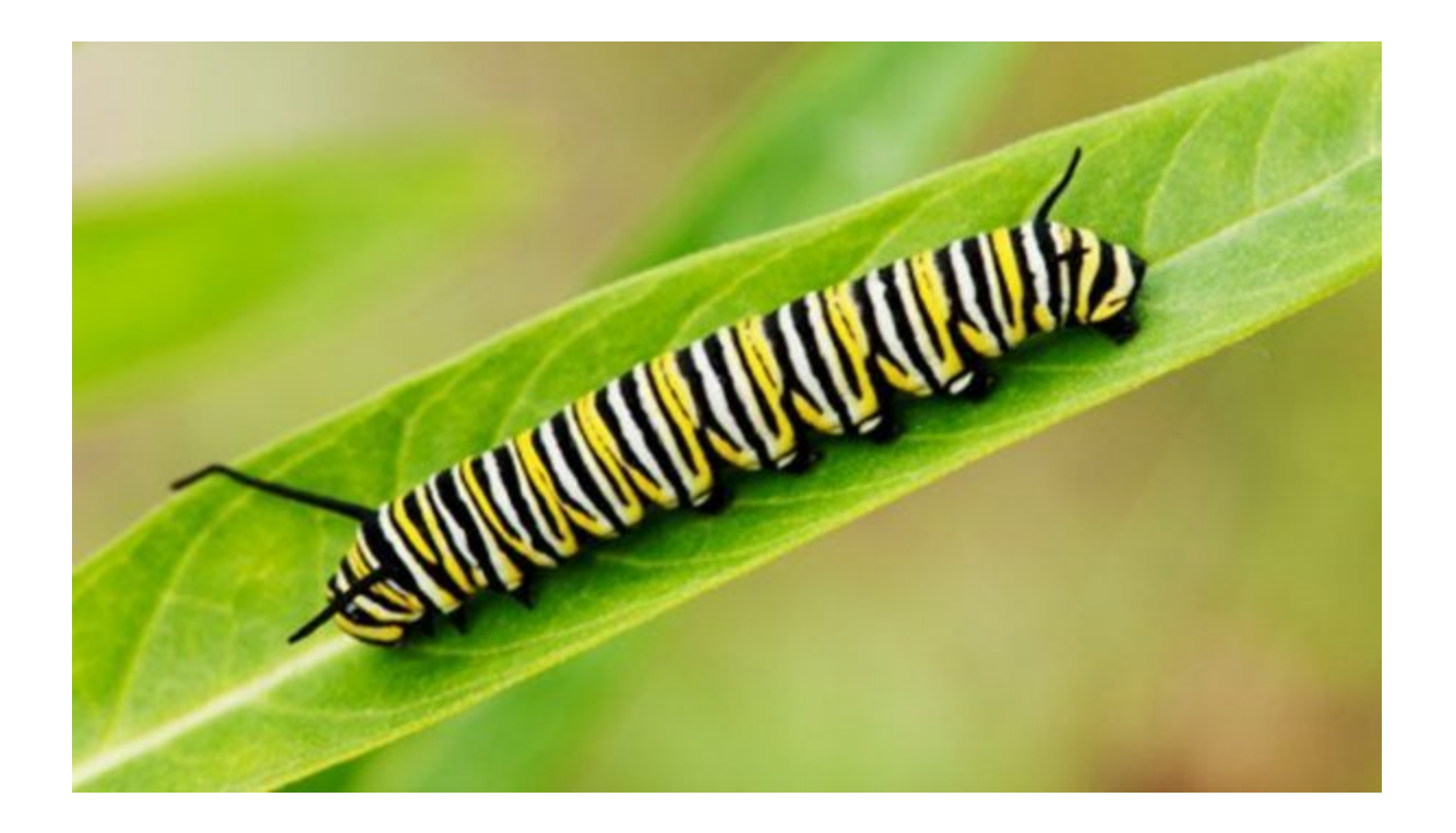
Stage 2: the caterpillar

Once ready, the caterpillar leaves its egg home and enters the big outside world! And these little critters arrive as hungry as can be – they actually eat their way out of the egg and immediately start chomping on the leaves of the host plant. During this stage, they shed their skin four or five times – as the caterpillar grows, its skin becomes too tight and splits open, revealing a new, larger skin underneath. A fully grown caterpillar can be over 100 times larger than when it emerged from its egg. That's amazing!